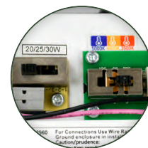
Easy access to CCT & Wattage Select switch underneath lens